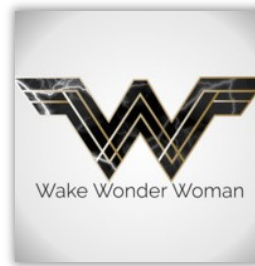
Wake Wonder Woman

For more Wake Forest University events, please visit: WFU Event Calendar .