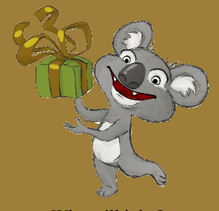
Who will it be? Facilities & Campus Services Nominate someone at <u>F&CS-elect</u>.